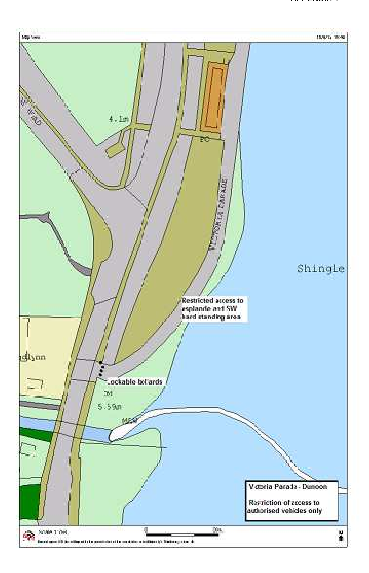
Page 1 of 2