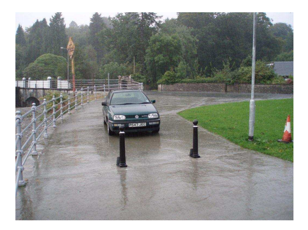
Page 2 of 2

Initial trial, two bollards adjacent to lighting column. Keys still to be distributed prior to locking of bollards in permanent position. Driver behaviour and potential effect on grass area to be monitored.